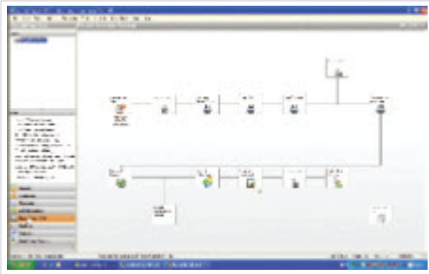
Quick Links Panel

It's now easy to find and carry out many less common tasks thanks to the new Quick Links panel - whether the tasks are related to sickness, maternity, paternity, adoption, printing historical reports, past payslips, or P32 reports. It's not every day that someone calls in sick or falls pregnant... but when they do, with Quick Links the solution is always right there in front of you.